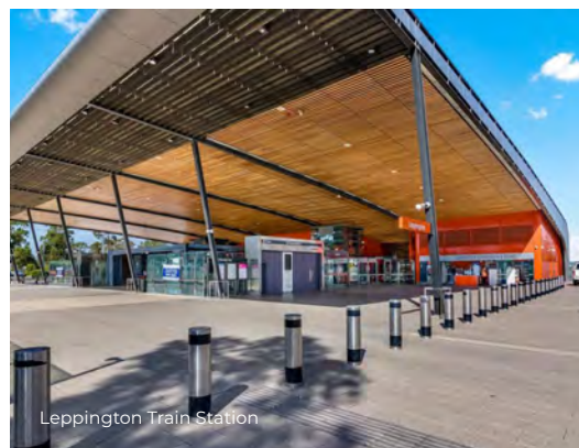
Leppington Train Station