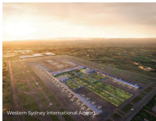
Western Sydney International Airport